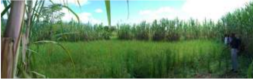
Rice Field, Phalombe YPU

This is done through fundraising and other voluntary activities to mobilize the population and to get money and other resources for new ideas and projects. For example, they have farming projects for soya beans, maize and rice and a pig farming project.