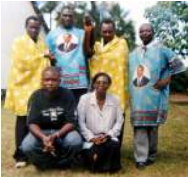
Conflict Management & Resolution Workshop, Thyolo YPU

One district attended a training workshop on conflict management and resolution, after which they decided to organize a workshop themselves in partnership with Malawi Human Rights Youth Network to train some political leaders in their district. In consequence an inter-party peace committee was created. Their aim is to build such committees also on local level in their district to create a conflict free society.