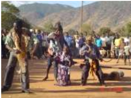
Sensitisation Tour, Rumphi YPU

In Blantyre they were given airtime on a radio programme once in a week for three months to tell the nation about their objectives and to discuss with them.